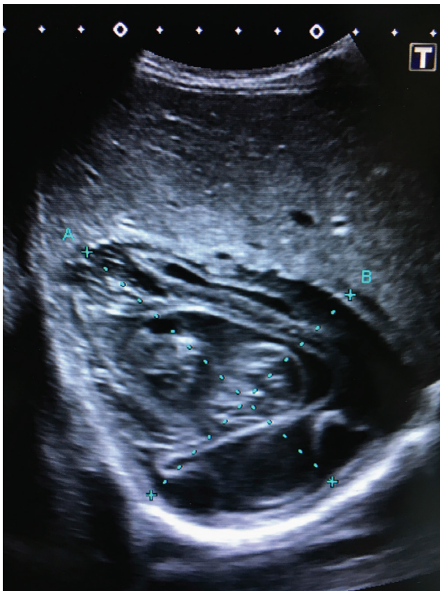
Figure 2. Decreased cyst appearance with more than 50% solidification of cyst content at 1-year follow-up in a patient treated using the standard catheterization technique with 12 days of catheterization

The PAIR procedure was used for the treatment of CE1 and CE3 cysts \leq 5 cm. The PAIDS procedure was used for the treatment of CE1 and CE3 cysts > 5 cm. The MoCAT procedure was used for the treatment of CE2 cysts and cysts with purulent contents. Thirty percent hypertonic saline was used as a scolical agent, while 95% ethyl alcohol was used as a sclerosing agent. The PAIDS and MoCAT procedures were initiated by following the same PAIR protocols and stages. Catheters of different thicknesses were inserted. A 6-8 F thick catheter (Bioteq, Taipei, Taiwan) was inserted into the cystic cavity in the PAIDS technique, while a 10-14 F catheter (Bioteq, Taipei, Taiwan) was used in the MoCAT technique. A collection bag was then attached to the tip of the catheter for