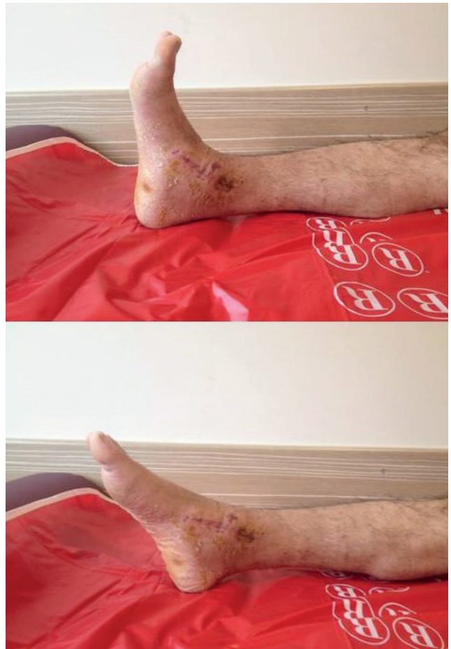
Figure 4. The patient had full movement of the ankle three months after surgery

The loss of the tendon contour over the ankle and weakness of dorsiflexion of the foot are highly suggestive