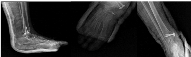
Figure 3. The anteroposterior and lateral radiographs of the ankle and the foot after surgery