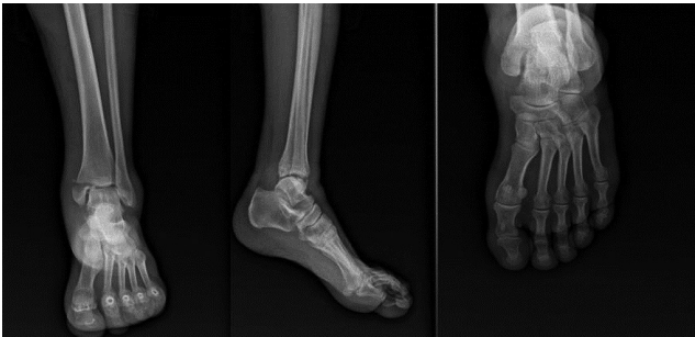
Figure 1. The anteroposterior and lateral radiographs of the ankle and the foot before surgery

The next day, the patient was mobilized on the healthy limb using two Canadian walkers, and was discharged on the second day. The short-leg splint was removed six weeks later, and a rehabilitation program that included passive and active ankle exercises was initiated. Full weight-bearing was allowed in the eighth week after surgery. At the three-month follow up, the patient had a full range of motion (Figure 4), and the American Orthopedic Foot and Ankle Society (AOFAS) score was 90 according to mild pain after a long walk. At the six, 12, and 18 month follow ups, the patient had no complaints, and the AOFAS scores were 100.