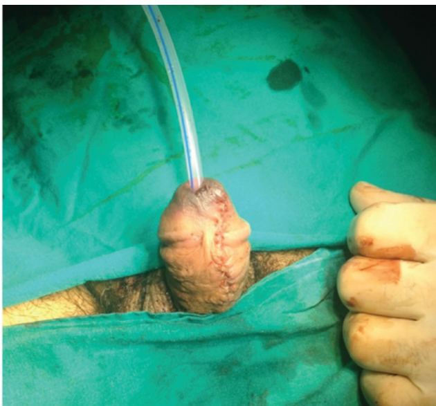
Figure 2. The glans penis after reconstruction

stenosis during the follow-up, meatotomy was performed. One month after the intervention, the micturition pattern was normalized and the surgical wound was completely healed.