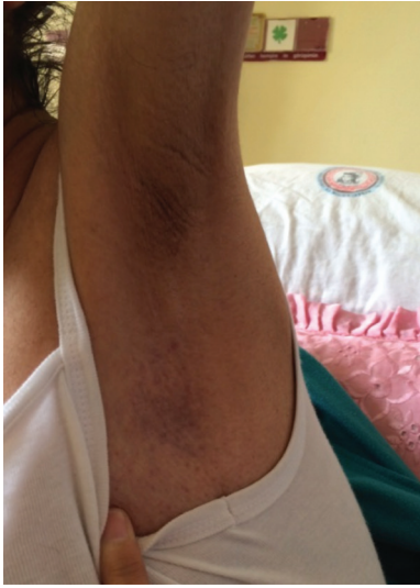
Figure 1. Axillary acanthosis nigricans as a feature of Cushing's syndrome