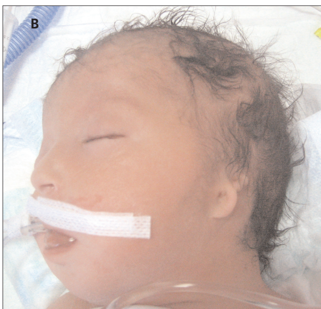
Figure 1. Patient with Goldenhar's syndrome: Bilateral dysplasia of the external ears, bilateral preauricular skin tags (A,B)

Affected individual may have unilateral microphthalmia, and upper eyelid coloboma, hypoplastic jaw, hypoplasia of the facial musculature, microtia, low set ears, preauricular tags, pretragal blind-ended fistulas, dysplasia of the external ear, hemivertebra or hypoplasia of cervical, thoracic or lumbar vertebrae, epibulbar dermoids or lipodermoids, cleft lip and/or palate as well as cardiac, renal and central nervous system anomalies (3,8,14). In some cases, the development of specific features and the severity of the clinical presentation were related to cerebral alterations frequently described in the literature (15,16).