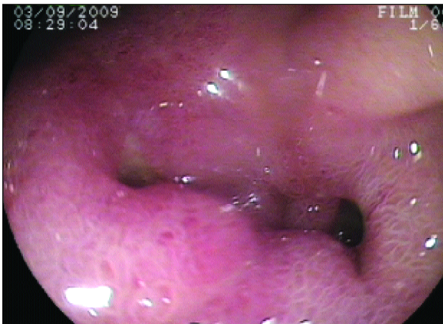
Figure 3. Endoscopic imaging of ulcer on the anterior wall of bulbus

In addition; Lopes et al. (8) speculated that local protease activation at sites of pulmonary vascular injury may account for abnormal degradation of vWF and possibly other proteins.