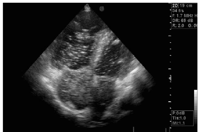
Figure 2. Contrast echocardiography demonstrating right-to-left shunt